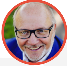
MAYOR TOM ROSS CITY OF MINOT