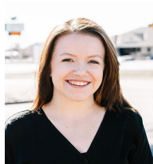
Aubrey Crosby Minot Health Clinic