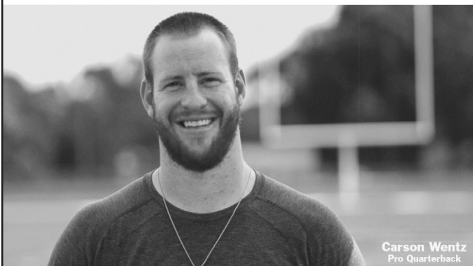
Carson Wentz Pro Quarterback