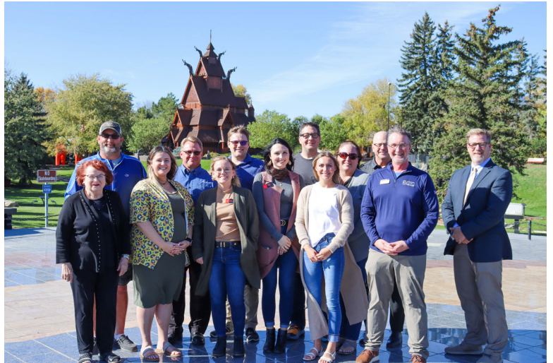
Pictured above are board members from Norsk Høstfest with the EPIC Events team in Minot, ND.