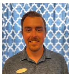
Cody Tofteland Hyatt House - Minot