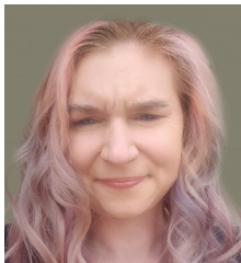
Victoria Conner Domestic Violence Crisis Center, Inc.