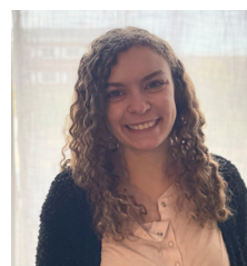
Savannah Watterson Hyatt House - Minot