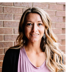
Tiffany Burckhard-Teets Chiropractic Health and Wellness