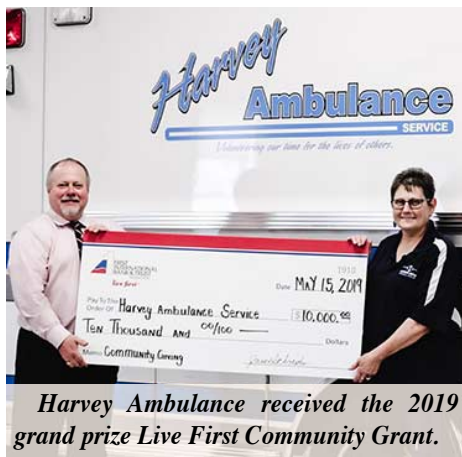
Harvey Ambulance received the 2019 grand prize Live First Community Grant.

Additional details and official rules can be found on the First International Bank and Trust website (FIBT.com) and by visiting the First International Bank & Trust Facebook page.