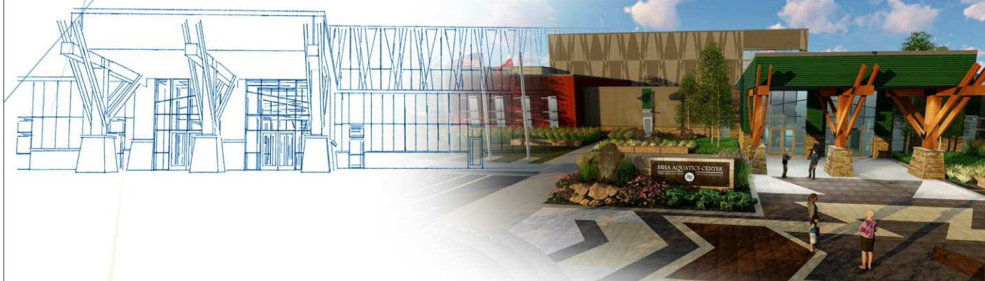
CONCEPTUAL RENDERING MHA AQUATICS CENTER, NEW TOWN, ND