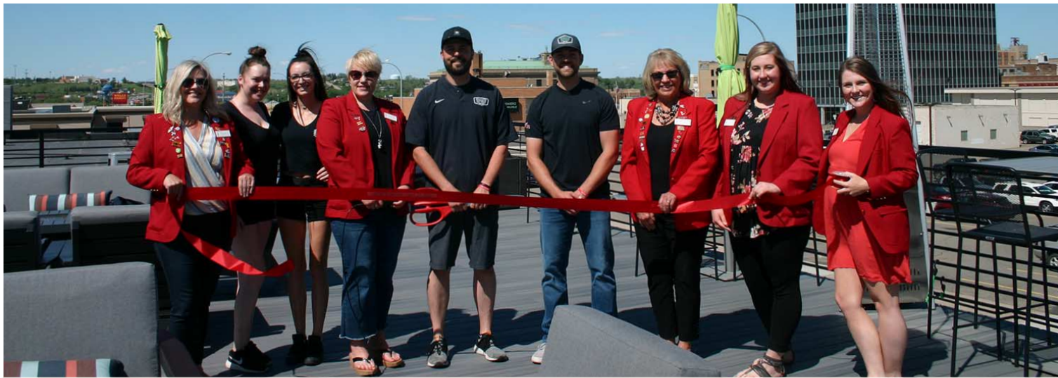
Sports On Tap: 220 S. Broadway, #A • Minot, ND 58703 • 701-837-8220 • sportsontapminot.com Minot Chamber Ambassadors helped celebrate a new addition to Sports on Tap. They cut the ribbon on top of the building for the rooftop bar that is now open. Stop by and enjoy the view of the city!