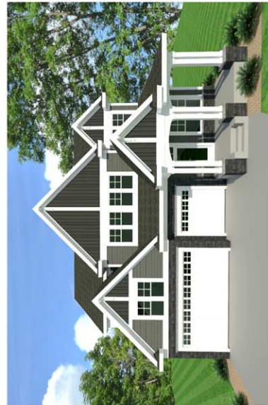
THE OAK – Single-Family