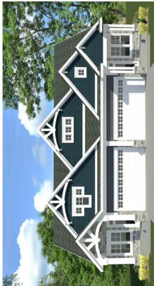
THE ASPEN – Villa