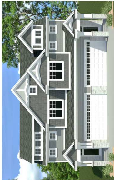
THE BASSWOOD – Villa