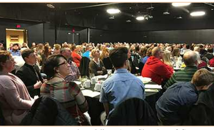
these Minot Area Chamber of Commerce members.