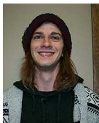
KALE SCHAAN Buffalo Wings & Rings