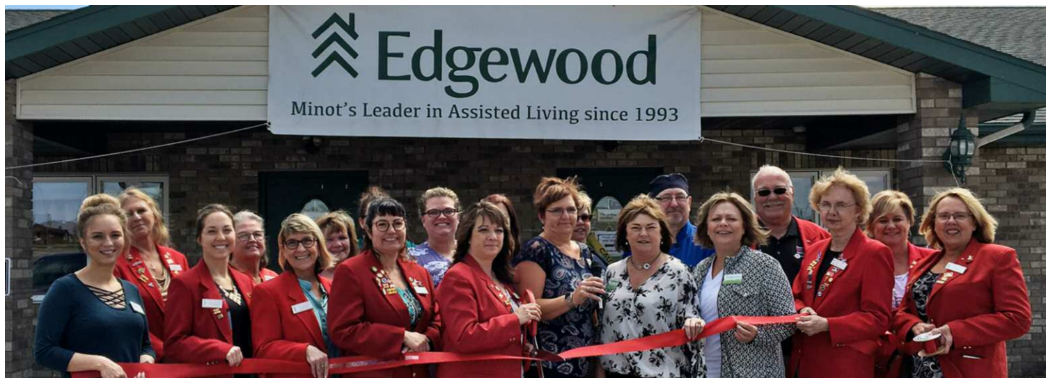
Edgewood South: 520 28th Ave. SE