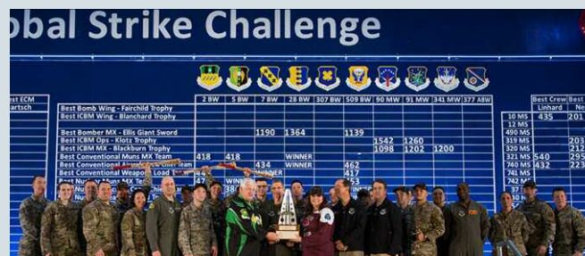
The community of Minot took home the Barksdale Trophy for the most outstanding community support to an Air Force Global Strike Command base during the 2019 Global Strike Challenge scoreposting Nov. 20 at Barksdale Air Force Base, La.