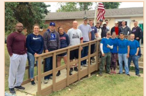
Volunteers from Minot AFB helped at the Men's Winter Refuge during last year's Magic Day of Giving.

Magic Day of Giving is organized and coordinated by a group of volunteers from non-profits and area businesses. Learn more about Magic Day of Giving at www.magicdayofgiving.org and on Facebook at www.facebook.com/engagingforimpact .