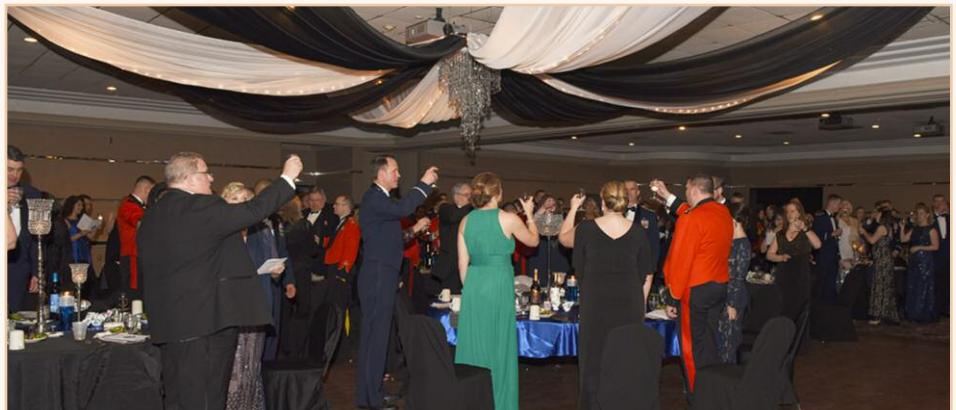
Those in attendance honored those who are gone but not forgotten by raising their water glasses in honor of all KIA, MIA and POWs.

Mark next year on your calendar: Saturday, April 6, 2019 at the Grand Hotel.