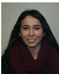
DECEMBER OSTER Tropical Tan