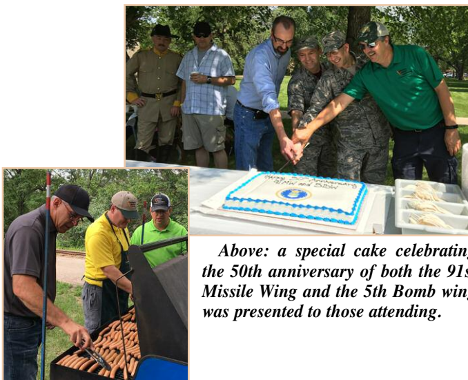
Above: a special cake celebrating the 50th anniversary of both the 91st Missile Wing and the 5th Bomb wing was presented to those attending.

Thank you also goes out to CHS SunPrairie for the use of their grill and to the staff of the Minot Park District and Roosevelt Park Zoo for all their help in making this happen!