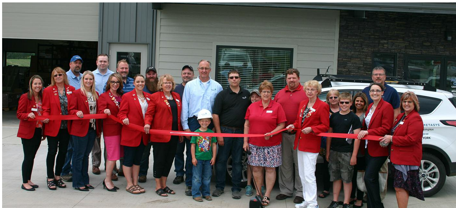
Johnson Controls: 1251 30th St NW, Suite B • 866-818-5332

Minot Chamber Ambassadors cut the ribbon at the new office for Johnson Controls. While they have been in Minot for many years, they have never had an office as employees have worked from home. Johnson Controls is a leading provider of equipment and controls for heating, ventilating, air-conditioning and refrigeration, as well as security systems for buildings.