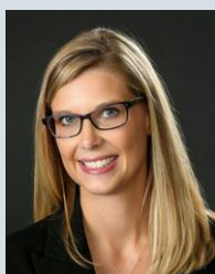
Shannon Webster Town & Country Credit Union