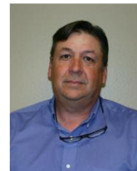
DARL ENGA Pinkerton Animal Hospital