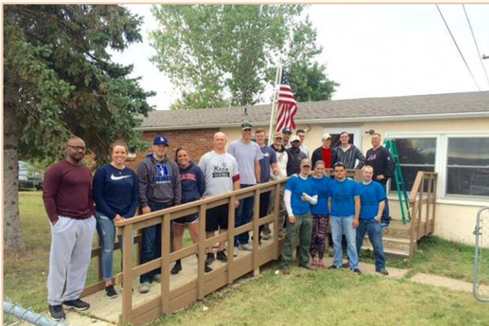
Volunteers from Minot Air Force Base helped at the Men's Winter Refuge during last year's Magic Day of Giving.

Magic Day of Giving is organized and coordinated by a group of volunteers from non-profits and area businesses. Learn more about Magic Day of Giving at www.magicdayofgiving.org and on Facebook at www.facebook.com/engagingforimpact .