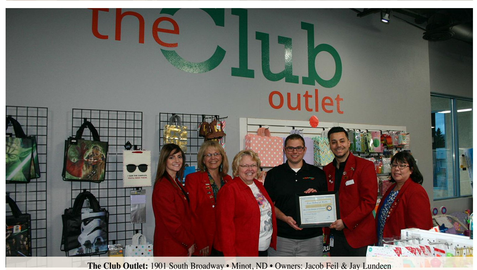
The Minot Chamber Ambassadors awarded a First Dollar of Profit award to the Club Outlet. The store features high-quality merchandise and returned products from hig box retailers and wholesale clubs, offering 20, 60% discounts on elething

ty merchandise and returned products from big box retailers and wholesale clubs, offering 20 - 60% discounts on clothing, electronics, non-perishables, furniture, housewares, toys, jewelry, paper products, appliances, bedding and more.