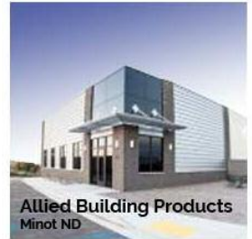
Allied Building Products Minot ND