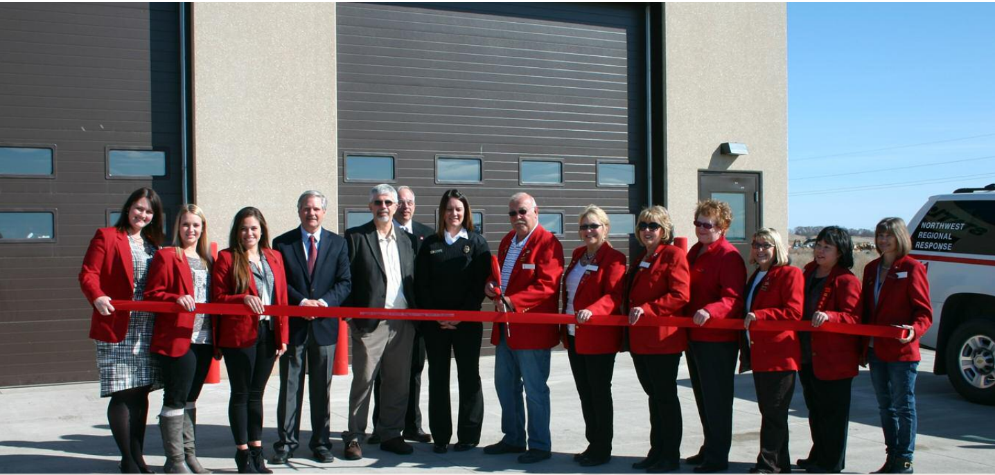
55th Street Fire Station: 1505 55th St. SE • Minot, ND 58701 • www.minotnd.org The Chamber's Ambassadors helped celebrate the opening of Minot's newest fire station.