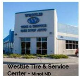
Westlie Tire & Service Center - Minot ND