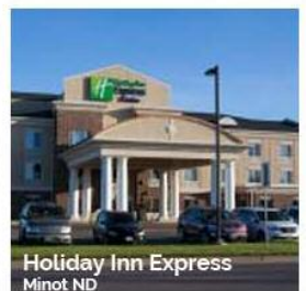
Holiday Inn Express Minot ND