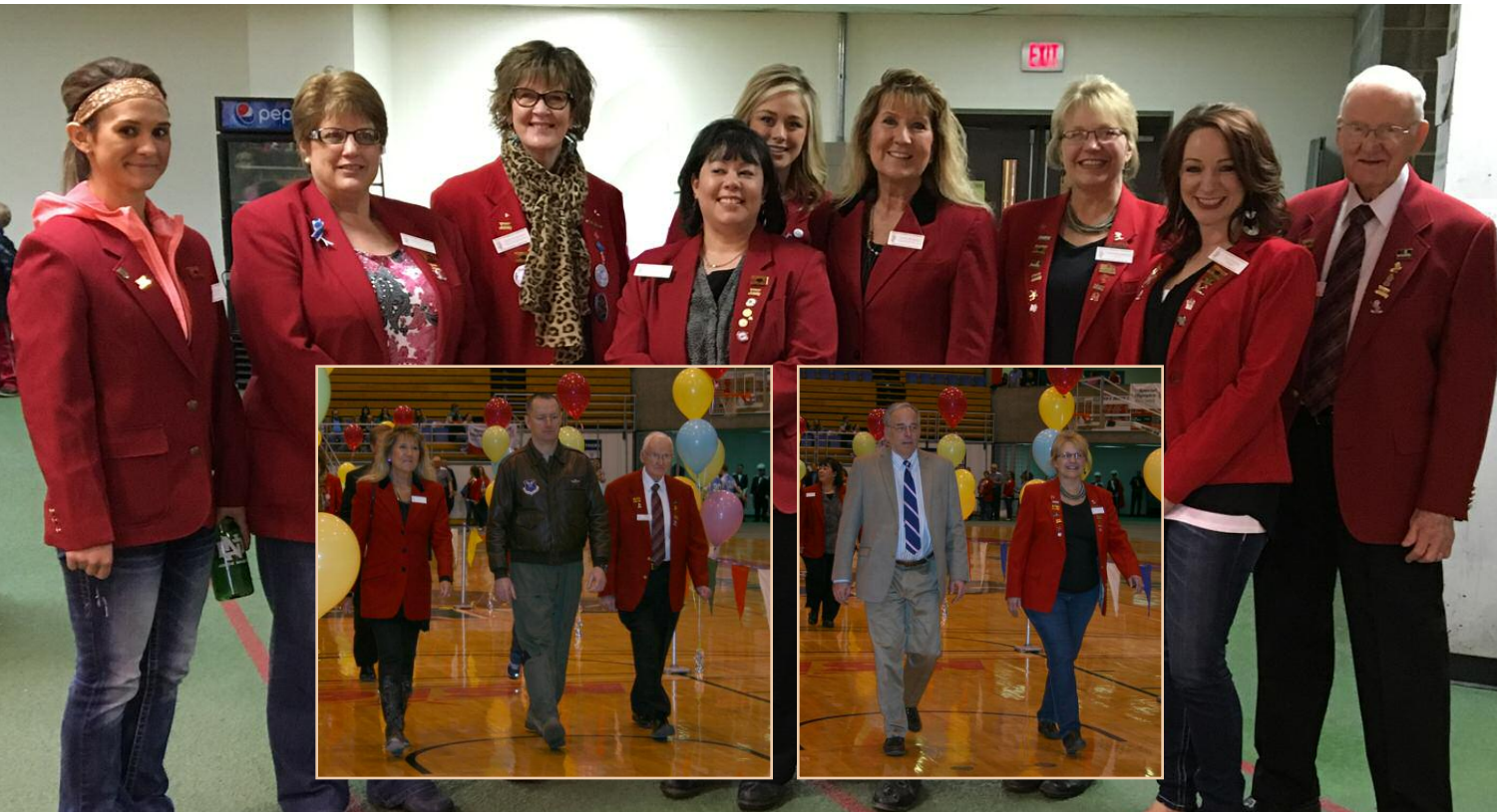
The Chamber's Ambassadors escorted honored guests at the 2016 Special Olympics State Basketball Tournament, which was held at the Minot State University Dome in March.