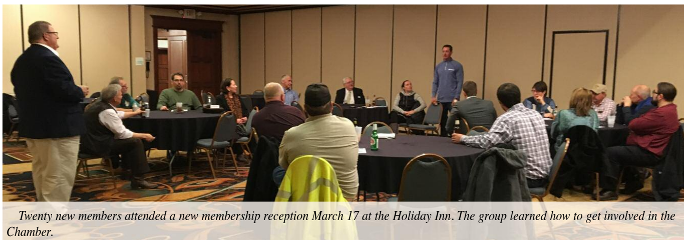
Twenty new members attended a new membership reception March 17 at the Holiday Inn. The group learned how to get involved in the Chamber.