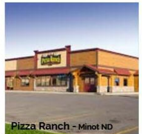
Pizza Ranch - Minot ND