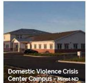
Domestic Violence Crisis Center Campus - Minot ND