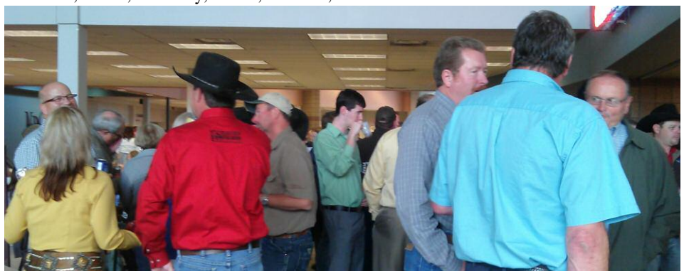
250 people enjoyed a great time at the annual Y's Men's Rodeo Business After Hours as they served delicious food, had great prizes and, of course, put on the best rodeo around.