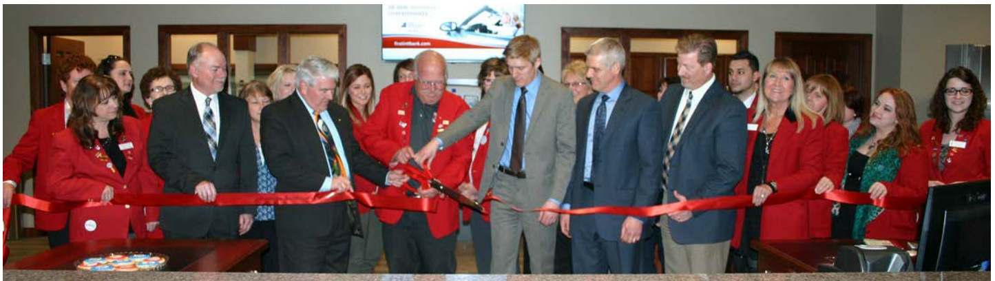
First International Bank & Trust: 2150 21st Ave. NW • Minot • 837-2050 • Watford City Bancshares, Inc., Owners • firstintlbk.com The Ambassadors helped celebrate the opening of First International Bank's 23rd branch and a third location in Minot, on North Hill.