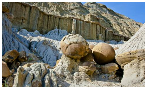
"Atlas Shrugged" from Theodore Roosevelt National Park, ND is one of Ken Dalgarno's badlands images on display at the Northwest Art Center's Hartnett Hall Gallery July 1 through August 6.

"There can be few places in the world where the visual impact of the landscape is as haunting-