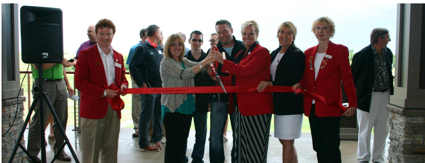
Elevation: 1912 Valley Bluff Dr. • Minot, ND • 837-0338

Ambassadors helped celebrate the opening of the new Minot Country Club. The Minot Country Club will offer world-class golf, a new clubhouse, golf shop, restaurant, and most importantly, will be a family friendly facility for the Minot community to enjoy.