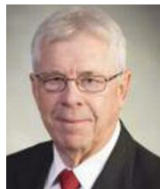
Sen. Rich Wardner

The time has come to stop treating the oil industry like a bottomless trough of money and recognize we have to foster its development in order to ensure continued success. The oil tax reforms passed in the last legislative session will not only ensure we have a dependable stream of oil revenues for education, water projects and infrastructure, but they will help North Dakota remain a great place to do business today and long into the future.