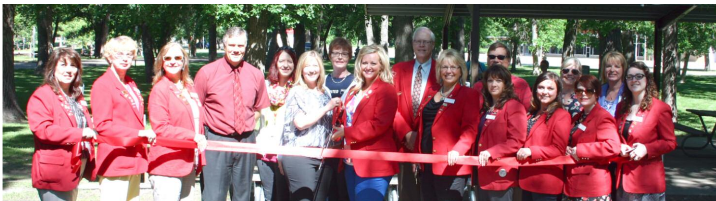
Minot Public Schools Summer Food Program: 215 2nd St. SE • Minot, ND • 857-8728 • Minot Public Schools Nutrition Services The Ambassadors helped celebrate the Summer Food Program, sponsored by Minot Public Schools, Minot Public Schools Foundation, Souris Valley United Way, and Minot Park District. The program offers free nutritious meals to those under 18, or at a cost of $3 for adults in Oak Park daily from 11:30 a.m. to Noon through Aug. 14.