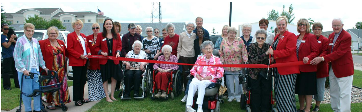
Brookdale Brentmoor Minot: 3515 10th St. SW • Minot, ND • 839-3320 • www.brookdale.com

Ambassadors helped celebrate the grand opening of Elevation, a bar and clubhouse located on the Minot Country Club facilities open seven days a week to the general public as well as club members.