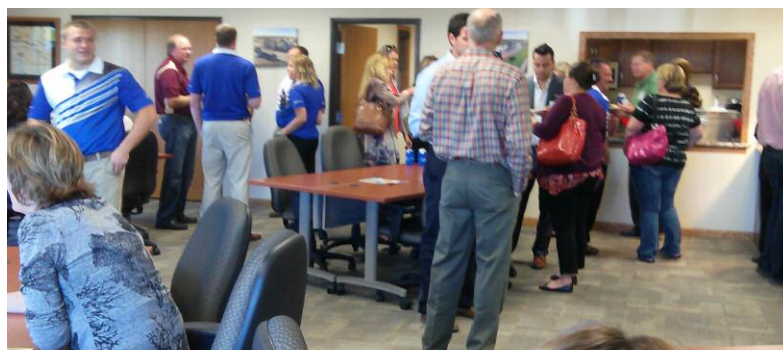
Thank you to CHS SunPrairie for sponsoring the first Business After Hours of the season September 24. Around 100 people were on hand to celebrate their Centennial.