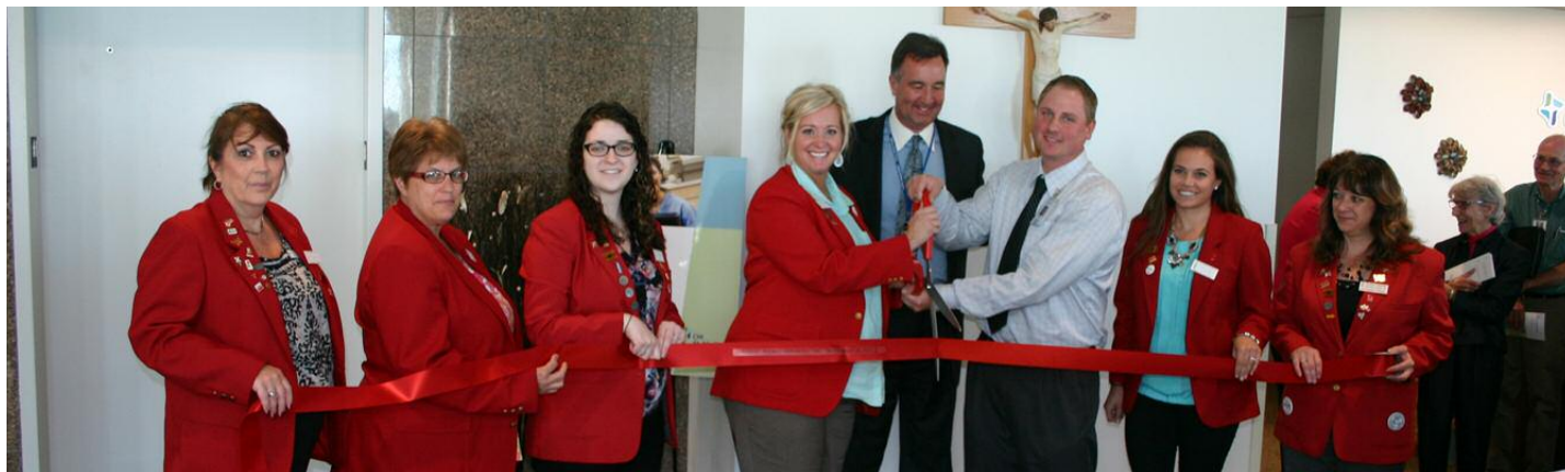
CHI St. Alexius Medical Plaza - Minot: 2111 Landmark Circle • Minot, ND • 857-8055 • www.st.alexius.org CHI St. Alexius Health Medical Plaza in Minot opened a new state-of-the-art facility in September and held a blessing, ribbon cutting, and open house later that month. The plaza features primary and specialty care exam rooms with the added convenience of having clinical services under one roof. First Choice Therapy is located on the second floor, and North Hill Pharmacy will open in January 2016.