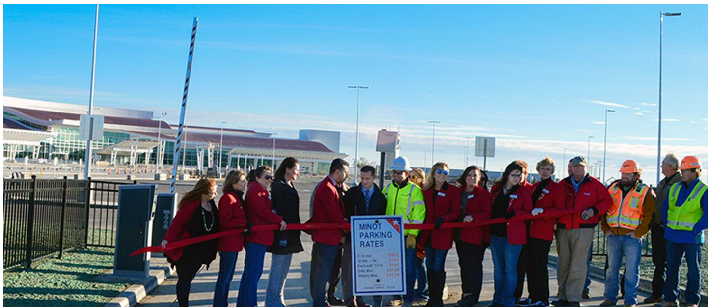
Minot International Airport Parking: 25 Airport Road, Ste. 10 • Minot, ND • 857-4724 • www.whyflyminot.com

The new airport terminal parking lots are now open. The long-term lot was completed in 2014 with the Phase II short-term lot under construction in 2015. The short-term lot is located directly in front of the new terminal building. The original parking lot provided 440 paved parking areas with various overflow lots located throughout airport grounds. The new parking lot will have 800 spaces in the long-term lot with another 645 spaces in the short-term lot. The current parking rate is $10 per day or $45 per week. However, new parking rates are being proposed and will be reviewed by the City Council in the coming months. The amount of spaces now available will be able to handle peak holiday travel periods and are expected to last for years to come.