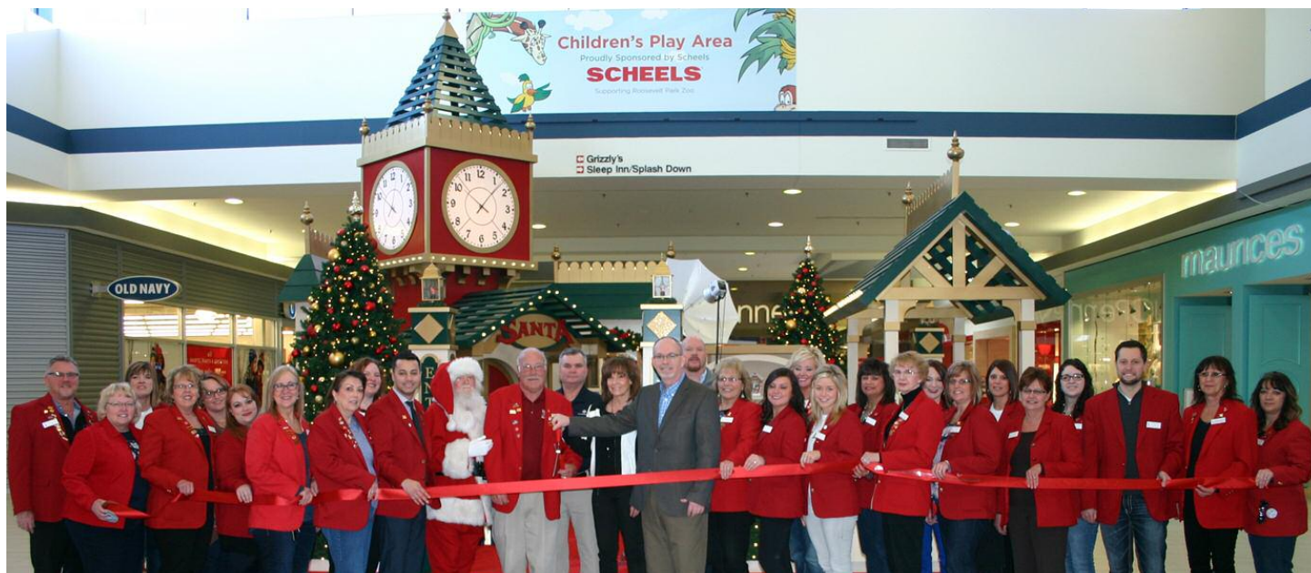
Dakota Square Mall (CBL & Associates Properties, LLC): 2400 10th St. SW • Minot, ND • 839-7500 • www.shopdakotasquare.com Ambassadors helped Dakota Square officially mark the completion of a multi-million dollar interior renovation. Dakota Square is proud to showcase the fresh, vibrant, and modernized mall interior to shoppers and the local business community.