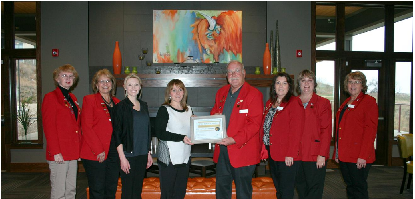
Elevation: 1912 Valley Bluff Drive (located inside the Minot Country Club) • Minot, ND • 837-0338 • www.elevationminot.com Ambassadors helped Elevation staff celebrate with a First Dollar award. The restaurant opened June 25 and is open year-round, seven days a week.