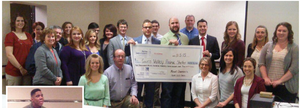
Above: 2015 CLI graduates raised $4,300 for the Souris Valley Animal Shelter.