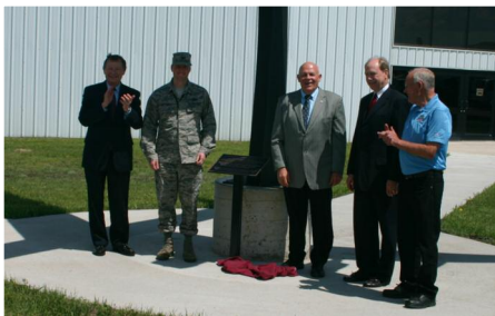
the dedication plaque for the B-52 model at the Air Museum.