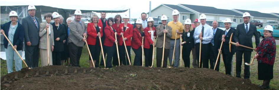
St. Alexis Medical Plaza: Intersection of Landmark Circle and 21st Ave. NW near Hyatt House and U.S. Highway 83 Bypass Representatives from St. Alexis Medical Sister, Sisters of the Annunciation Monastery, and the Chamber Ambassadors were on hand to help break ground at the future location of the St. Alexis Medical Plaza. See related story on page 6.