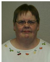
MARY NEW Town and Country White Drug