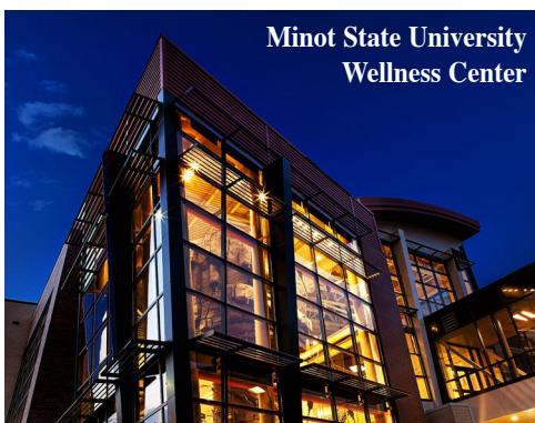
Minot State University Wellness Center