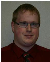
WILL BRAND American Bank Center