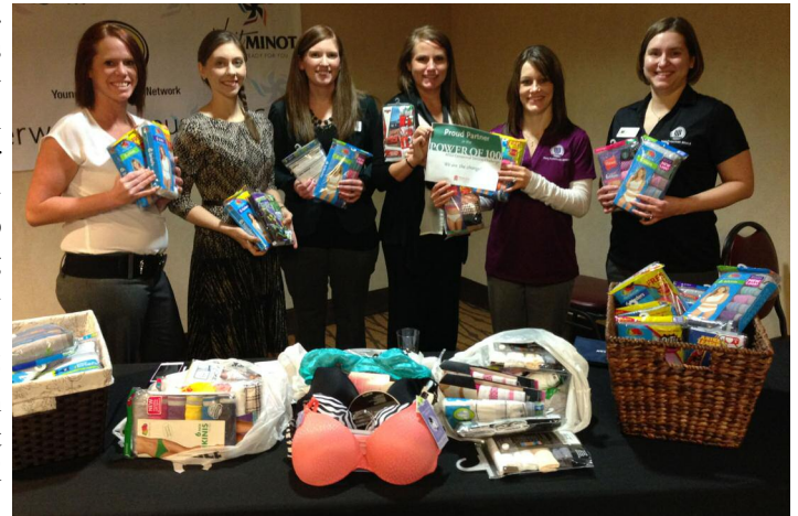
Members of the Minot YP Outreach Team stand with the items collected for the Domestic Violence Crisis Center.

rent and potential members. Since Oct. 1, YP Minot has added more than 25 new members. This event will provide an opportunity for new, old, and potential members to connect. Membership in the Minot Young Professionals is open to anyone between the ages of 21 and 39. Annual dues are $25 and new members can sign up online and find a full list of upcoming meetings and events at ypminot.com .