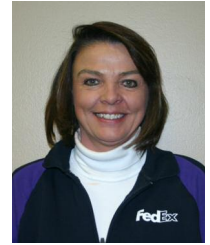
ADAIR EHR Federal Express