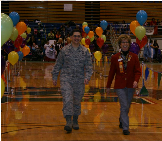
The Ambassadors escorted honored guests at the 2014 Special Olympics State Basketball Tournament at the Minot State Dome March 7.