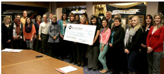
Minot Sertoma Club members present MSU faculty and students with a gift to the MSU Foundation.