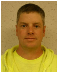
Jeff Anderson Excavating, Inc.