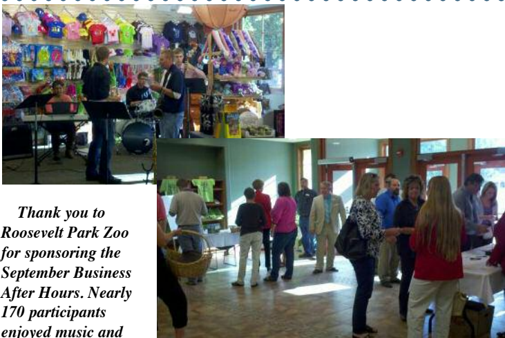
Thank you to Roosevelt Park Zoo for sponsoring the September Business After Hours. Nearly 170 participants enjoyed music and refreshments, as well as the opening of the new entrance building and zoo outreach animals.