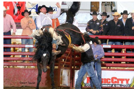
Bareback riding is part of the fun at the 2012 Badlands Circuit Finals Rodeo in Minot. Don't miss out on the best cowboys and cowgirls competing for championship gold buckles.

Tickets for the rodeo are on sale online at MinotYsMensRodeo.com and on sale at the Dakota Square Mall. Tickets for the Little Texas concert are sold separately and are available at the Spicy Pie in Minot (1100 North Broadway) and online at NdTICKETstop.com . For more informa-