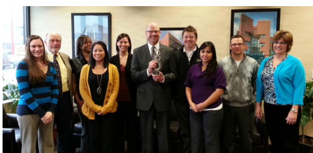
IRET employees pose with their award, the first-ever Impact Award, for their work within the community.