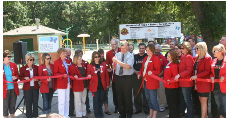
Oak Park Ribbon Cutting:

Farmers Insurance Latendresse Agency, a locally-owned agency, is excited to be serving Minot's needs for home, auto, health and life insurance.