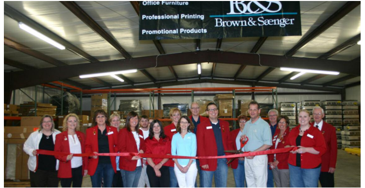
Brown & Saenger: 510 31st Ave. SW • Minot, ND • 858-0808