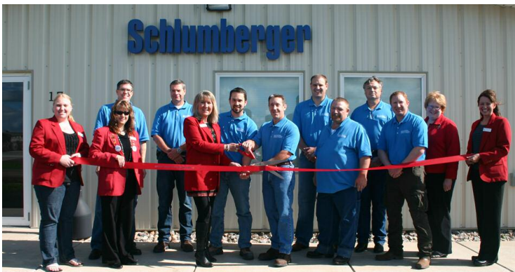
Schlumberger Completions: #17 40th ave NW • Minot, ND • 837-0664

The Minot community celebrated a weekend of hope, a return to Oak Park on June 22, the one-year anniversary of the Mouse River flood. The Minot Park District and Minot Community Foundation held a number of events to mark the occasion, including a ribbon cutting with Chamber Ambassadors.