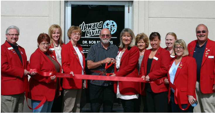
Upward Living: 312 3rd St. SW • Minot, ND • 852-1170