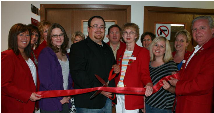
Farmers Insurance Latendresse Agency

Ambassadors cut the ribbon with Brown & Saenger employees and officials to celebrate the completion and opening of a 6,000 square-foot warehouse addition.