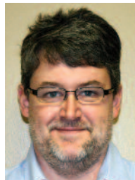
PETE LADENDORF Minot Daily News