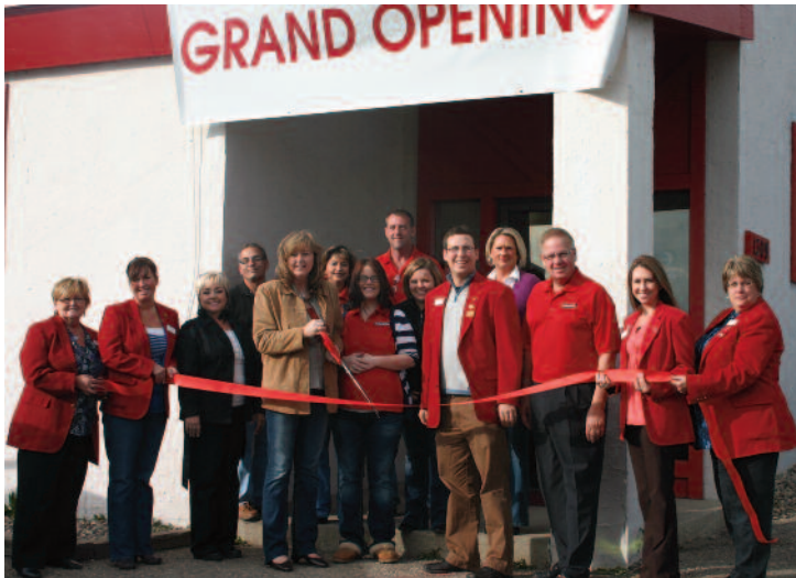
Bakken Staffing: 1309 N. Broadway • Minot, ND 58703 837-0904 • Fax: 837-6243