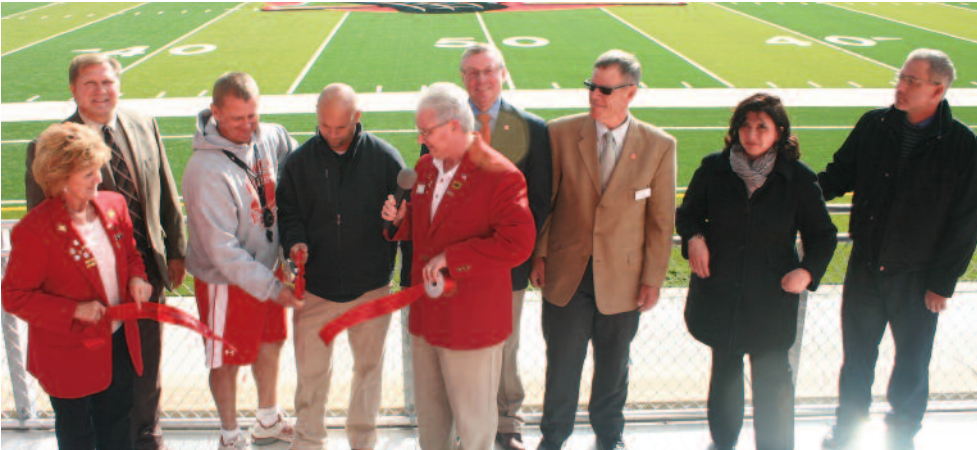
MSU Herb Parker Stadium: Minot State University • 500 University Ave. W • Minot, ND • 858-3041 www.msubeavers.com Minot State University Athletics officially opened the stadium seating section at the Herb Parker Stadium, completing phase two of a three-phase project.