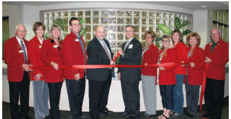
Trinity Health Advanced Imaging Center:

Ambassadors cut the ribbon at the new location of Vision Source in the Beaver Ridge Plaza.