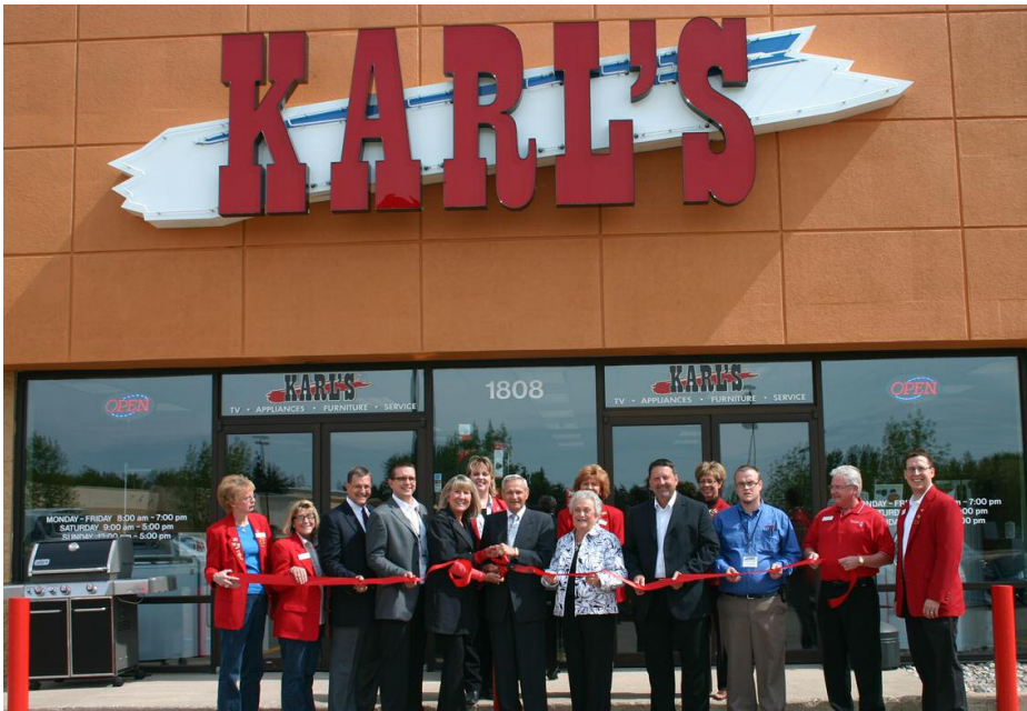
Karl's TV, Appliance and Furniture: 1808 22nd Ave SW • Minot 838-7245 • 800-903-0427 • www.karlsonline.com